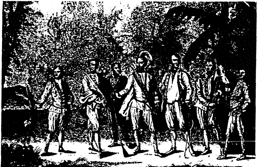
Attakullaculla, at far right, and six other Cherokees