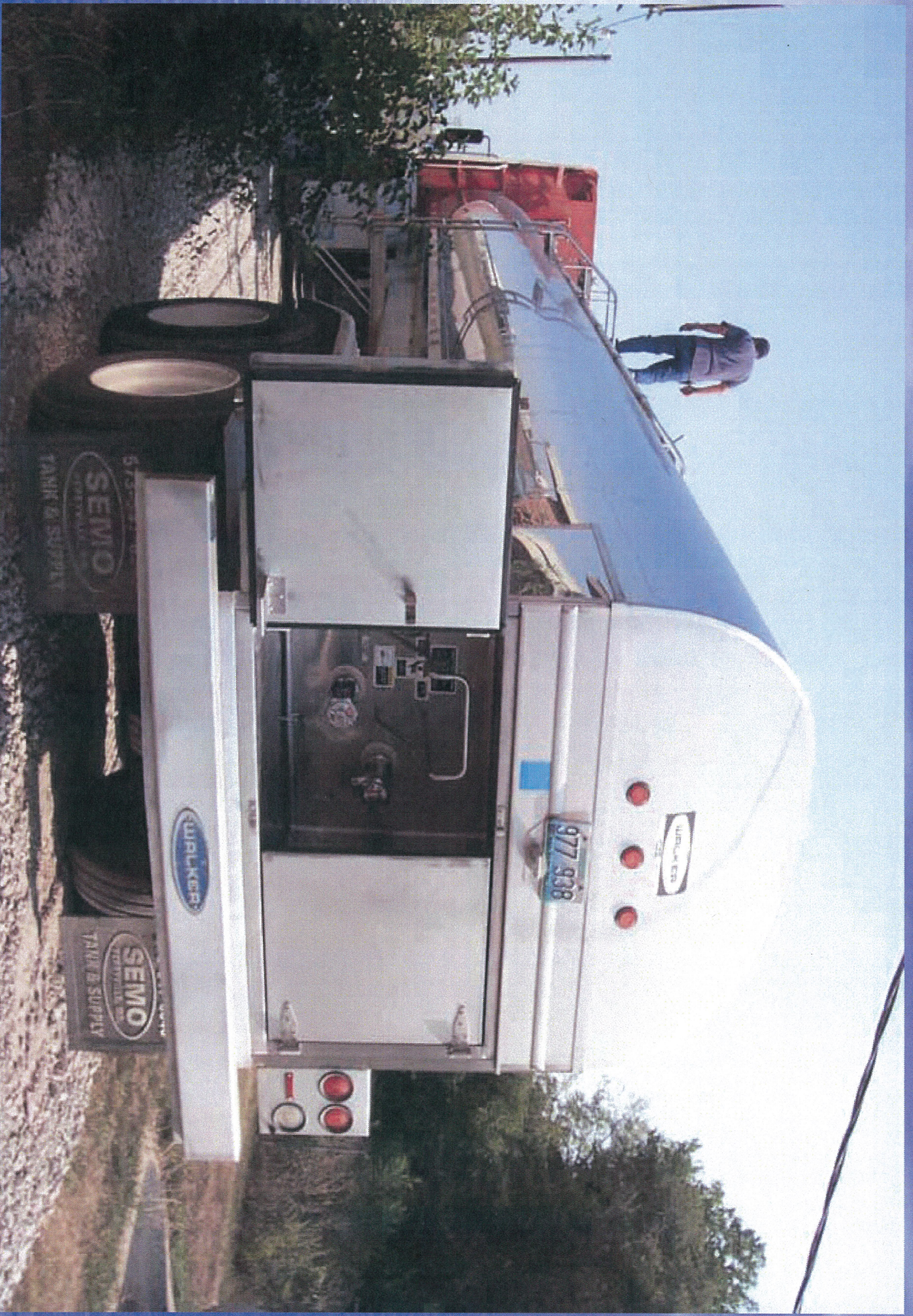
Kickapoo Water Plant – August 27, 2003